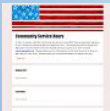
Community Service Google Form