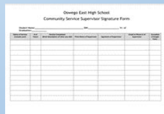
Community Service Supervisor Form (Download to Print or Make a Copy)

For Community Service Opportunities - please check the Community Service website for updated information. See attached page for some current opportunities.